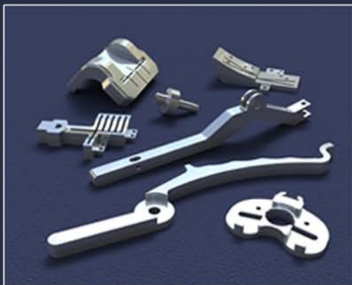
Orthopedic instrument components

Since 1971, our skilled engineers, toolmakers, and technicians have been delivering high precision solutions to various industries, including the medical industry. ISO-certified and FDA-compliant, we stand ready to handle your most challenging applications.