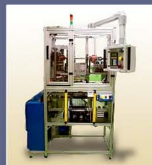
Custom automated equipment