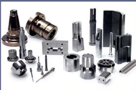
Carbide tooling components