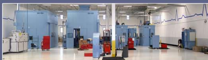
Dedicated medical stamping area